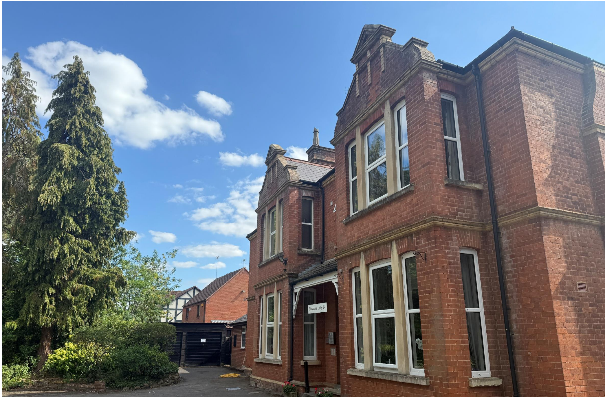
Flat 24 Hucclecote Lodge, Hucclecote Road, Gloucester, Gloucestershire, GL3